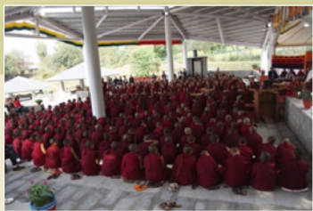
2014 Launch of Endowment Fund for the Jang Gonchoe