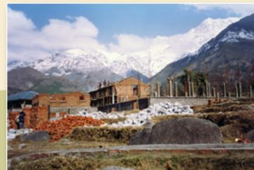
1993-2005 Dolma Ling construction is slowly completed