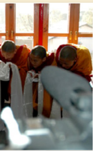
2005 His Holiness the Dalai Lama visits Dolma Ling Nunnery