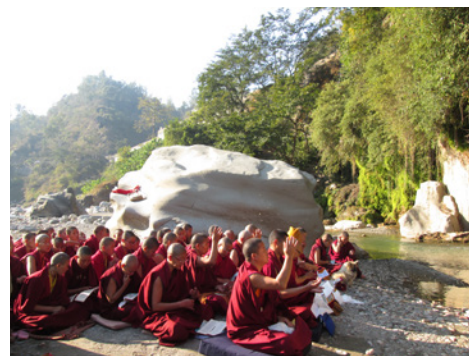
A special puja at Tilopa's cave

Each January and February, the nuns from Karma Drubgyu Dhargyay Ling Nunnery of Tilokpur join the Kagyu Monlam for World Peace. For the last two years, the nuns have also participated in the Kagyu nuns' debate session held every winter.