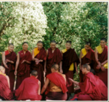
1992 Jugseph Nunnery established in India under TNP care