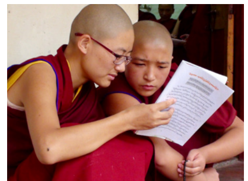
Quiz time at Dolma Ling

It's been a busy year at the nunnery, with many special events and activities. In early May, the Tibetan Women's Association organized their 8th week-long Buddhist Nuns' Empowerment Program. Nuns from Sakya College in Dehradun, from Orissa, and from Jangchub Choeling Nunnery in Dharamsala also attended the special event. This year, His Holiness the Dalai Lama expressed his concern about health problems in monasteries, nunneries, Tibetan settlements, and schools. Following this, members of the