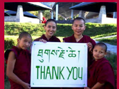
2017 30th Anniversary of the Tibetan Nuns Project