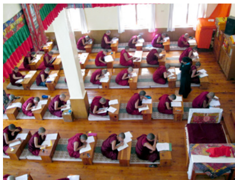
Written exams at Geden Choeling