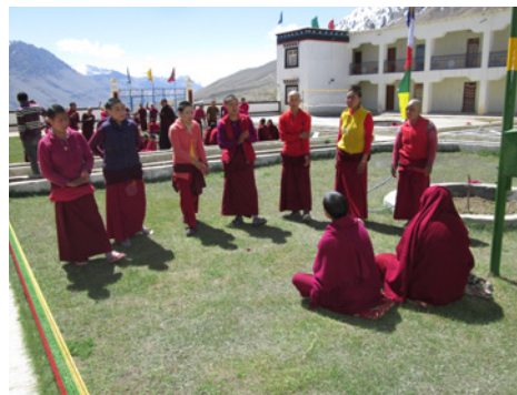
Taking advantage of the summer weather, nuns at Sherab Choeling debate outdoors

Apart from their studies, the nuns also spend a lot of time growing their own food and doing chores such as ploughing the fields and working in the greenhouses. They are successfully growing black and green peas, cabbage, and even cauliflower, much to their surprise and delight. This year they had scanty snowfall which made life at the nunnery much easier. However, it was a mixed blessing because of worry about water shortages in the valley's dry summer months.