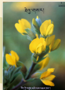
2003 TNP-sponsored nunneries start their own magazine