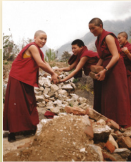
1993 Construction begins on Dolma Ling Nunnery