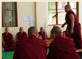
May 2016 Fourth and final round of Geshema exams all 20 nuns pass