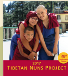
1993 First TNP calendar