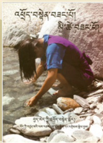
2005 Tibetan edition of Healthy Body, Healthy Mind on women's health