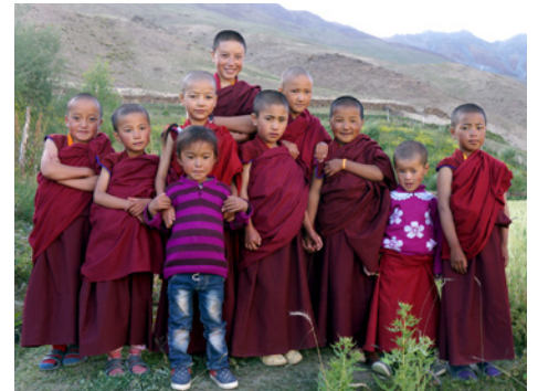
Young nuns at Dorjee Zong

Five new nuns joined this year, bringing the total to 24. The nuns come from villages close to the nunnery and they are often visited by their family members. The two eldest nuns are in their mid-80s, while the youngest nuns are just 7 years old. The seven senior nuns spend most of their time reciting mantras, preparing pujas requested by families who live close to the nunnery, and also organizing Nyungne, a special practice involving two