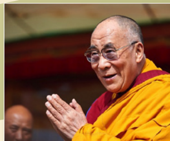
December 2016 Geshema degrees to be received from His Holiness the Dalai Lama by 20 nuns