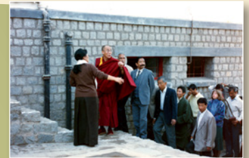
1995 With the first five buildings finished, His Holiness the Dalai Lama visits Dolma Ling