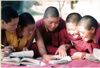
early 1990s Setting up of educational system and classes Many nuns who had escaped were totally illiterate