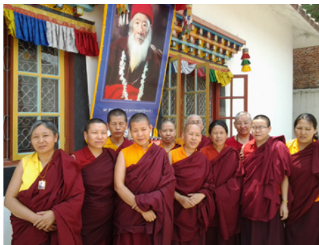
Shugsep nuns on retreat in Nepal